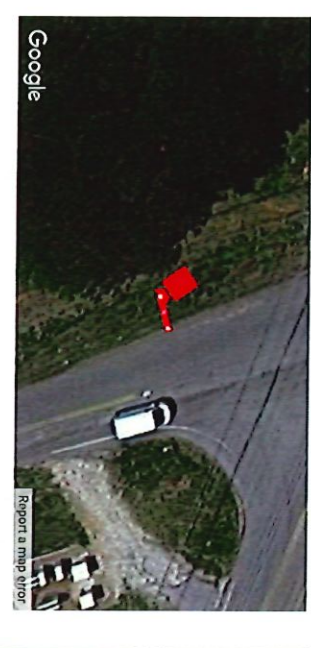
Distance: 10.4 ft.